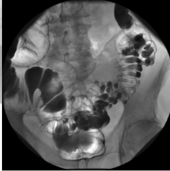
Barium enema colon diverticula, male, unknown age

The tilt table holds patients up to 500 pounds, providing easy access for bariatric patients. In static mode, the table can accommodate patients weighing up to 600 pounds.